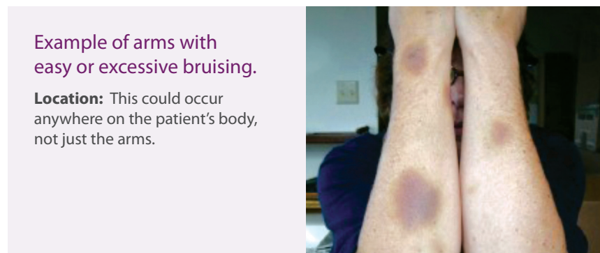
Figure 2 - Examples of ITP

Example of arms with easy or excessive bruising.