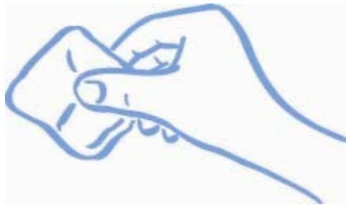
Figure B: Press with gauze or cotton ball