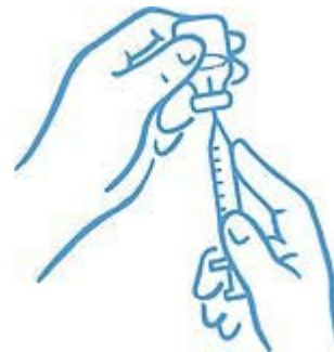
Figure 4: Needle tip in liquid