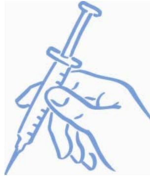
Figure 7: The syringe is ready for injection