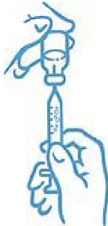
Figure 6: Remove air bubbles and refill syringe with liquid to obtain the correct dose