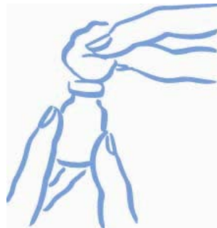
Figure 1: Wipe the rubber stopper with alcohol