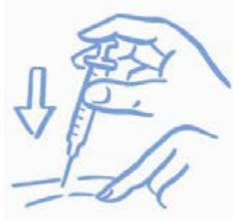
Figure A: Lightly pinch the skin and inject as instructed