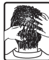
Massage the scalp