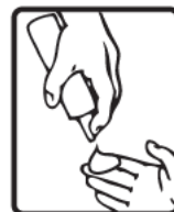
Turn the container upside down and press the spray nozzle