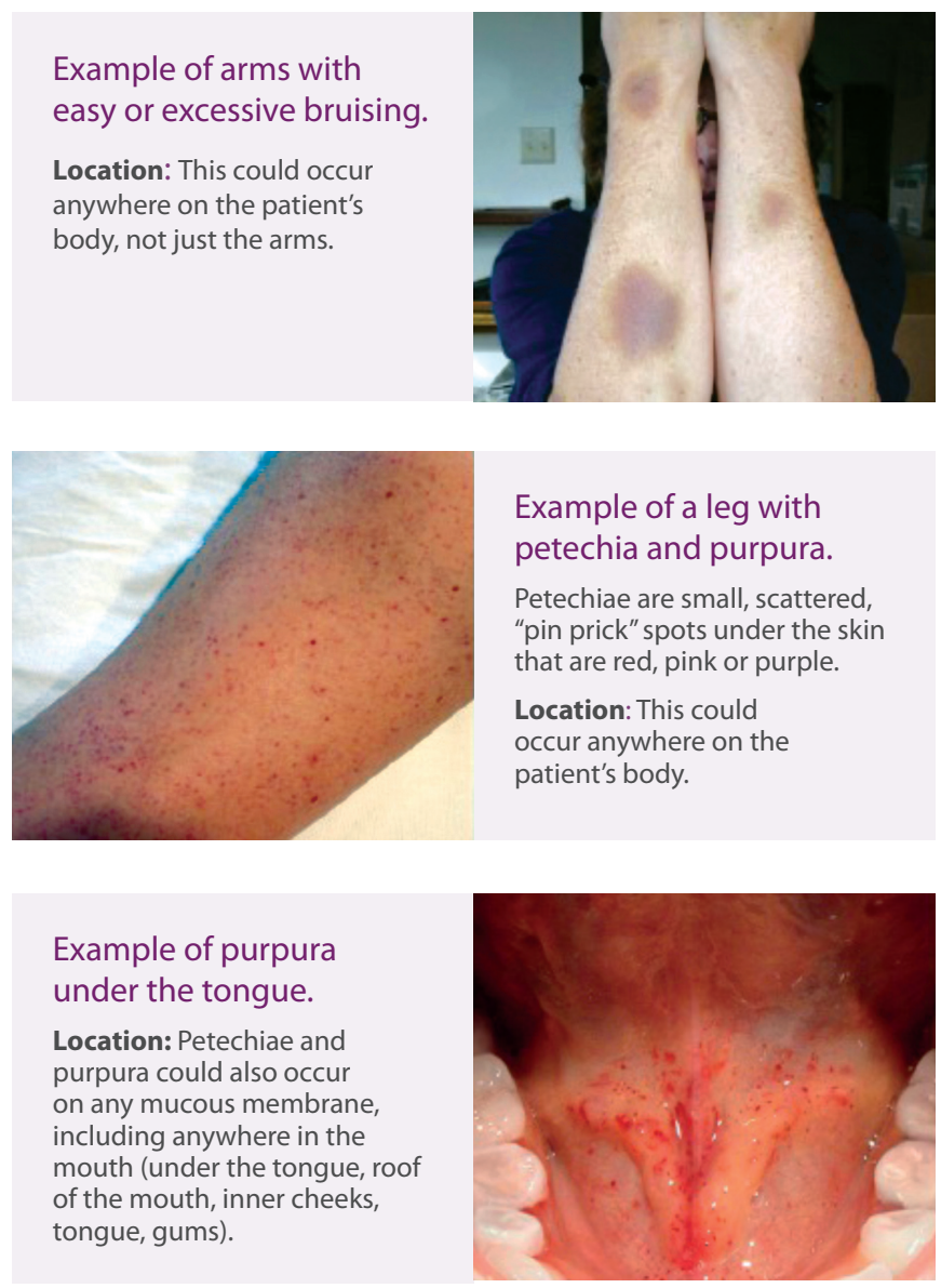
Figure 2 - Examples of ITP

Note: These pictures are only a guide in order to show examples of bruises or petechiae. The patient may have a less severe type of bruise or petechiae than these pictures and still have ITP.